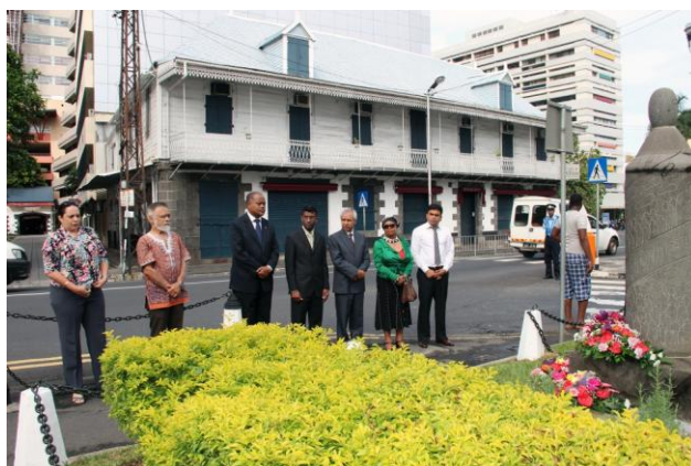
Abolition of slavery – Laying of wreaths – 01.02.2015