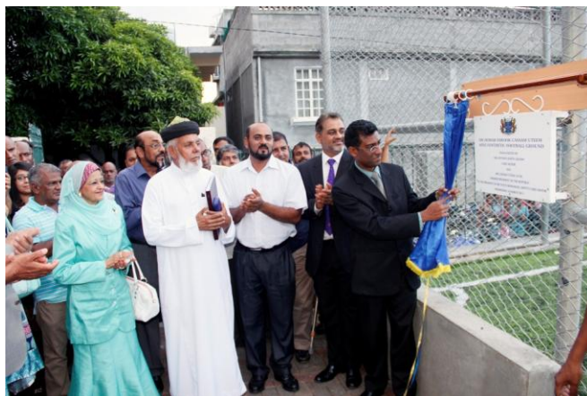
Inauguration of mini synthetic soccer pitch at Vallée Pitot – 18.03.2015