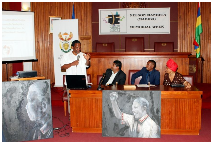
Memorial Week for Nelson Mandela – 3.12.2015