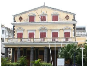
Port Louis Theatre