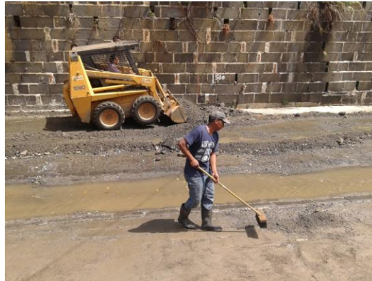
Clean up Campaign – Constituency no. 2 – July 2015