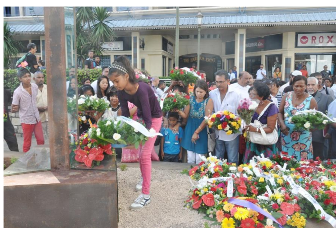
Tribute to victims of 30 th March 2013 floods Wreath laying ceremony at Caudan Waterfront – 30.03.2015