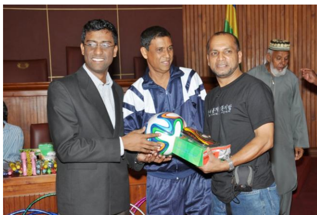
Handing over of sports equipment to 'Ecoles de foot' of Port Louis – 23.01.2015