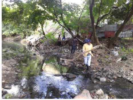
Cleaning Natural Storm Water Drain at Debarcadere – January 2015