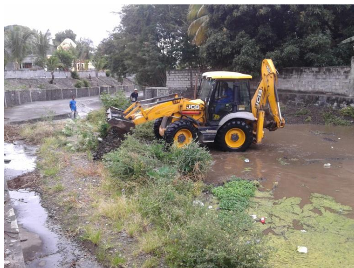
Clean up Campaign at GRNW – 6 December 2015