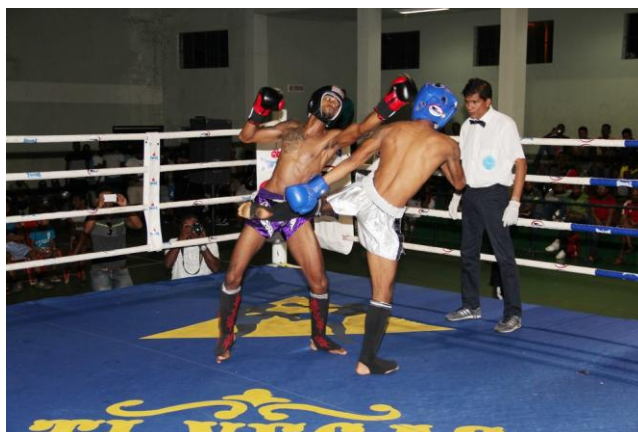
Kickboxing competition at Centre 1er février, Roche Bois – 14.03.2015