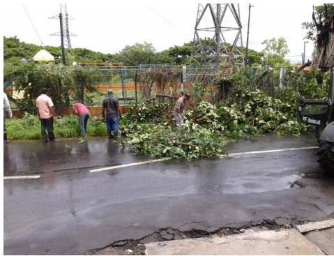
Removal of tree at Old Moka Road – February 2015