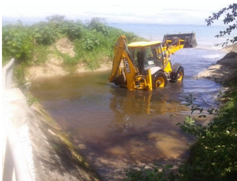
Cleaning Latanier River – April 2015