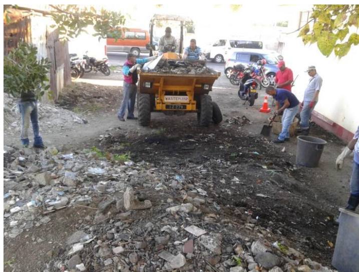
Cleaning Canal Anglais – October 2015