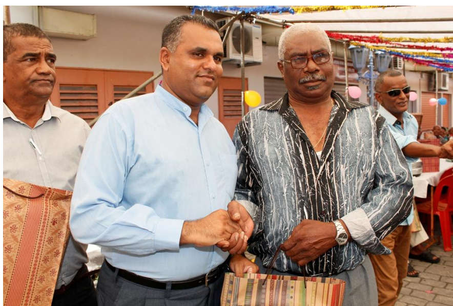
Remittance of gifts to senior citizens – 27.12.2015