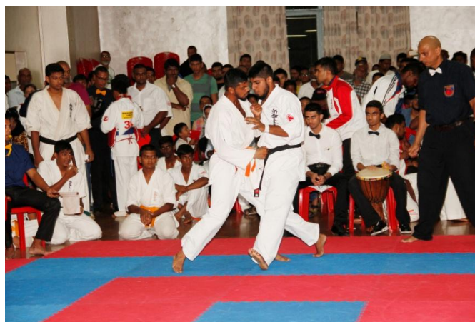
Kyokushinkai Karaté competition at Dr I. Goomany Centre – 28.03.2015