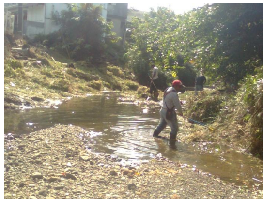
Clean up Campaign at Camp Chapelon – September 2015