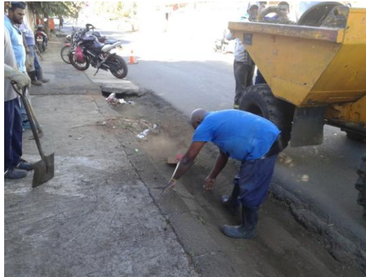
Clean up Campaign at Residence Sir Gaëtan Duval – June 2015